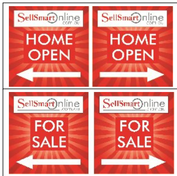
Optional - Directional Signs