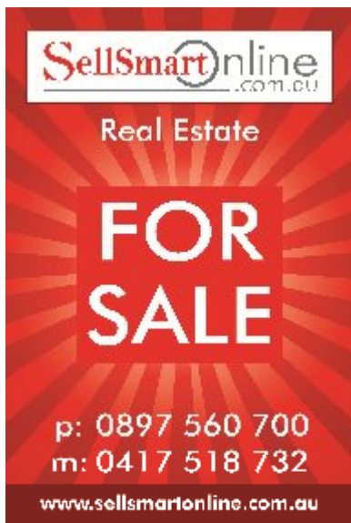
Compulsory - For Sale Sign